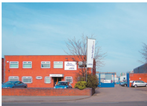
Manufacturing facility in Hull, England